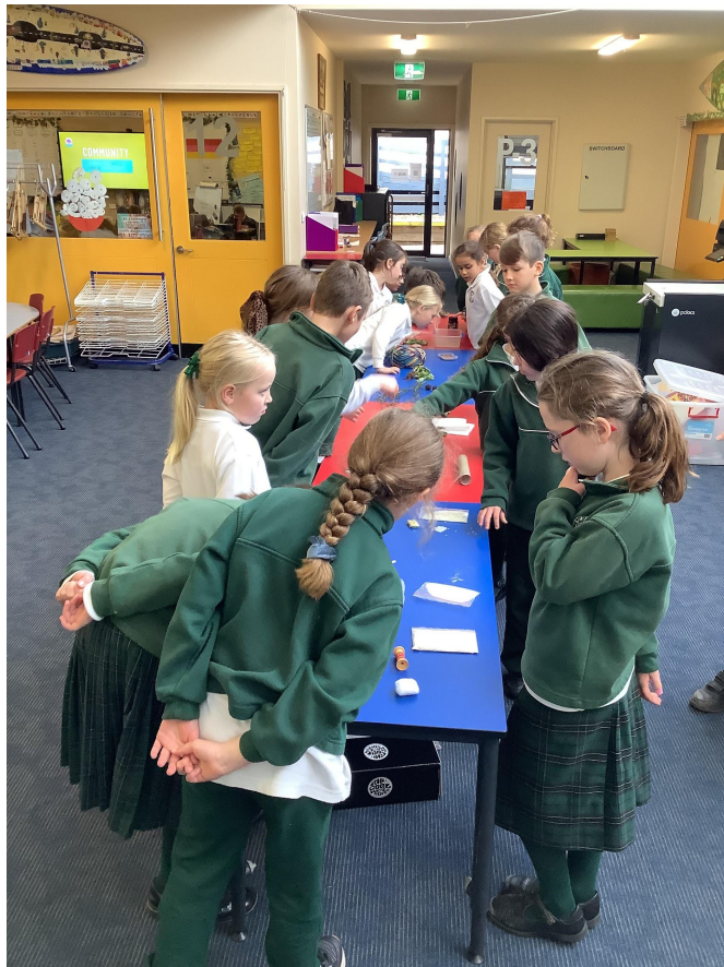
Exploring a number of materials and questioning where they originated from.